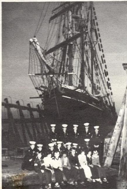
Neptune Sea Cadets pose with the Danish-built barquentine Our Svanen in Lunenburg, N.S.