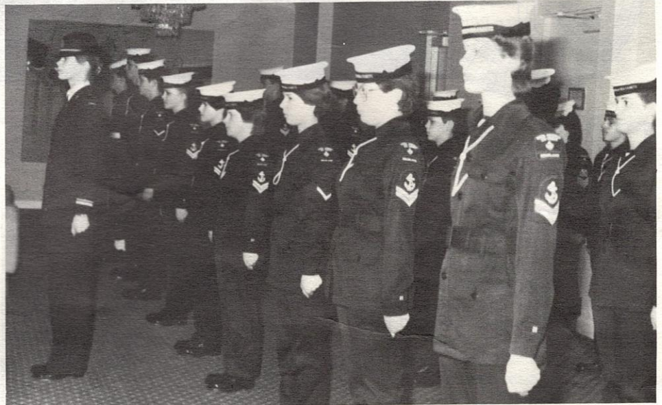
The RCSCC Falkland Honour Guard